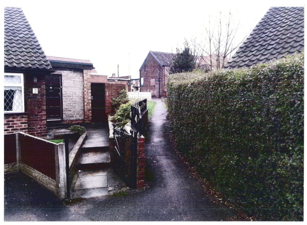
Fig.1: View from Elkan Road

In discussions between the Community Safety Team and the Area Forum it was concurred that the geography of this location does lend itself to encouraging anti-social / criminal behavior, as there is no direct view of the land adjacent to the path from the Elkan Road end of the alley alleyway. This is demonstrated in the photograph at Fig.1 below.